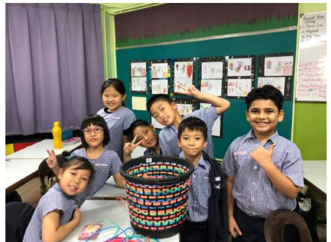
Our Year 3 students with their decorated bins!