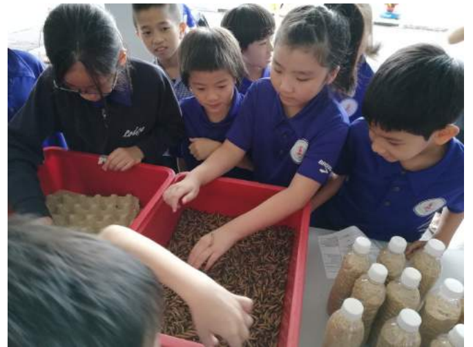
Worming Up with hundreds of worms!

Many thanks to our prefects who painted this beautiful mural at the school entrance!