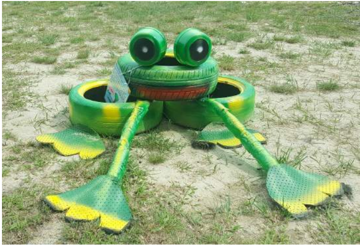
Year 5B's entry into the Upscaled Tyres competition