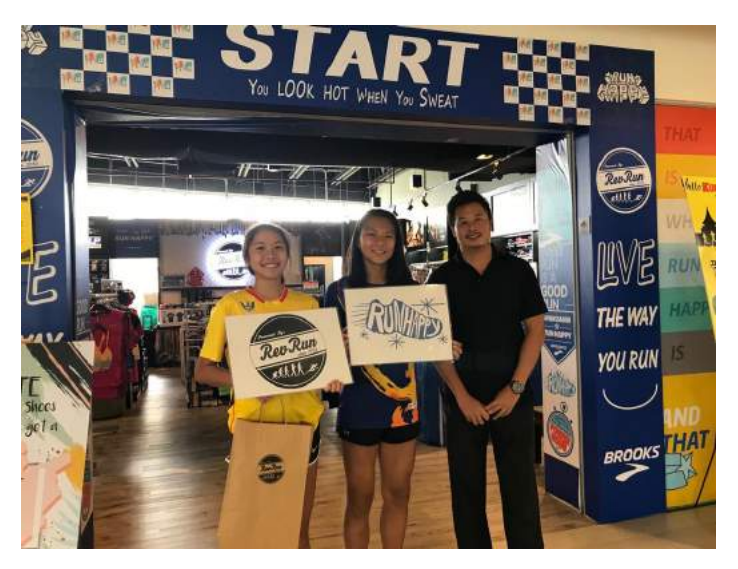
Thank you, Revolution Run Borneo Sdn.Bhd (Brooks Attires), for sponsoring these two Lodge athletes with training shoes, tights and compression socks.