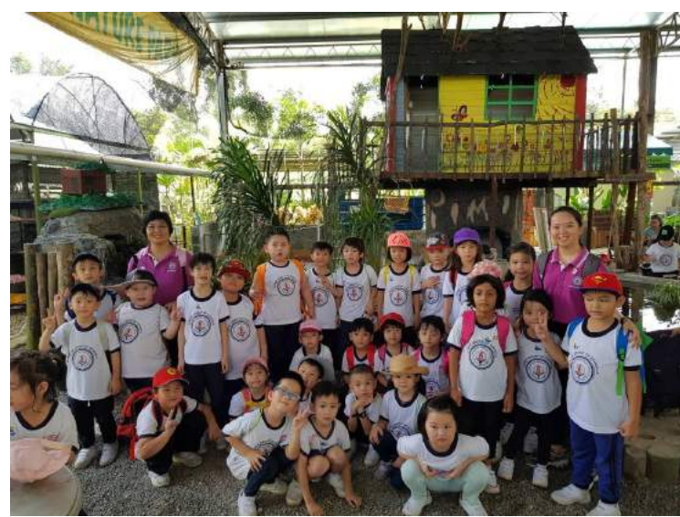
Kindy C made a trip to VH Green Nature Park during the month of April!

The students were very excited to see the different animals and being able to experience nature. Around 111 children, along with parent helpers and teachers, participated in this trip which began with a bus journey (which was a great adventure in itself!). They were welcomed by the Park guides who brought them around to see and touch the animals.