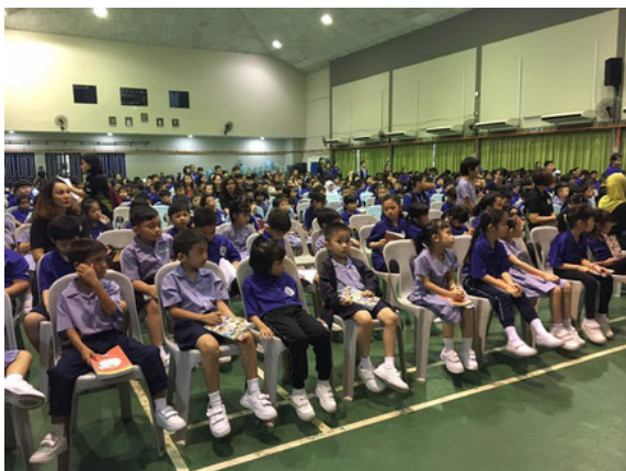
Our first school assembly!

To allay their worries, we organised an orientation programme for our new parents, where they were assured of a holistic education programme here at Lodge School. Our Director and Principal reiterated that our goal is for our students to excel not only academically, but also in terms of their character, learning attitude, and co-curricular activities.