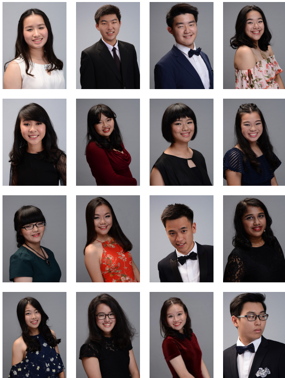
IGCSE top students, many of whom are excellent all-rounders.

Lodge International School obtained outstanding results for the October/November 2017 Cambridge IGCSE and AS Level exams.