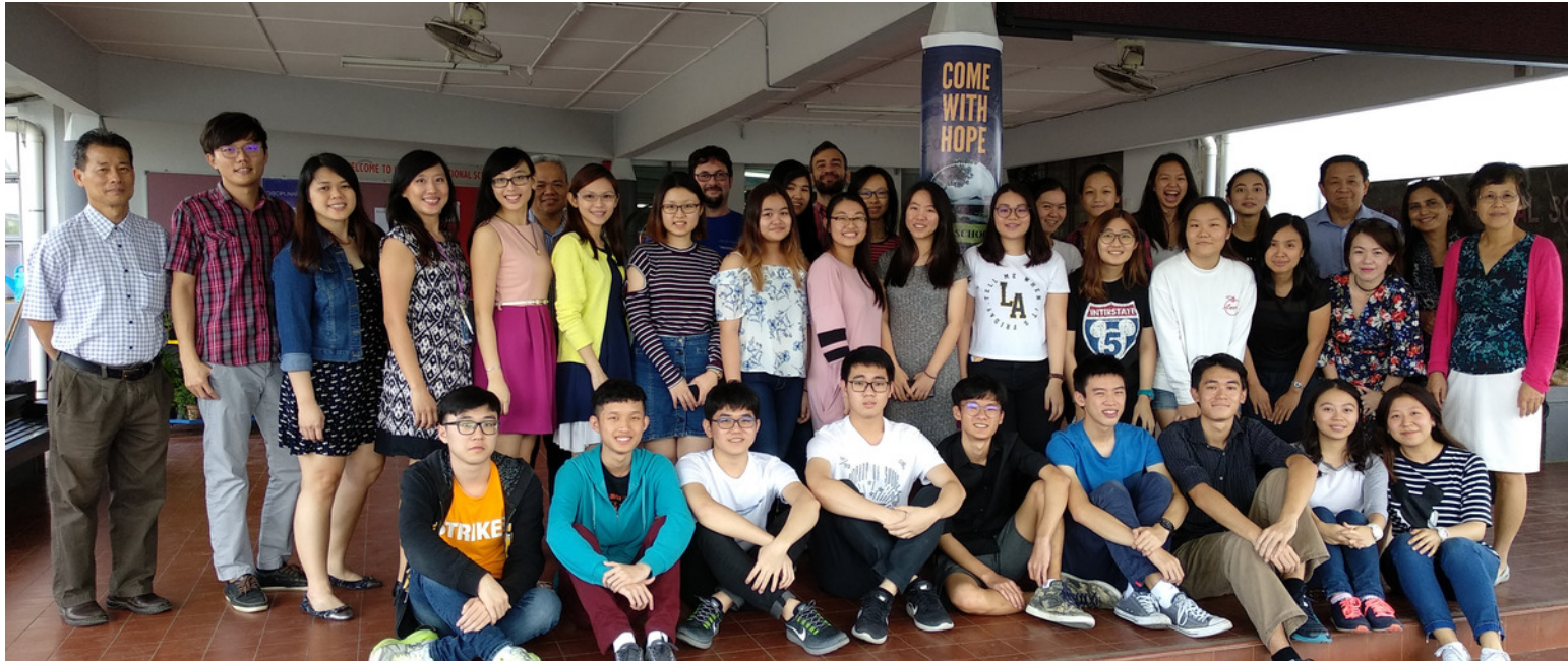
AS-Level top scorers with their proud teachers